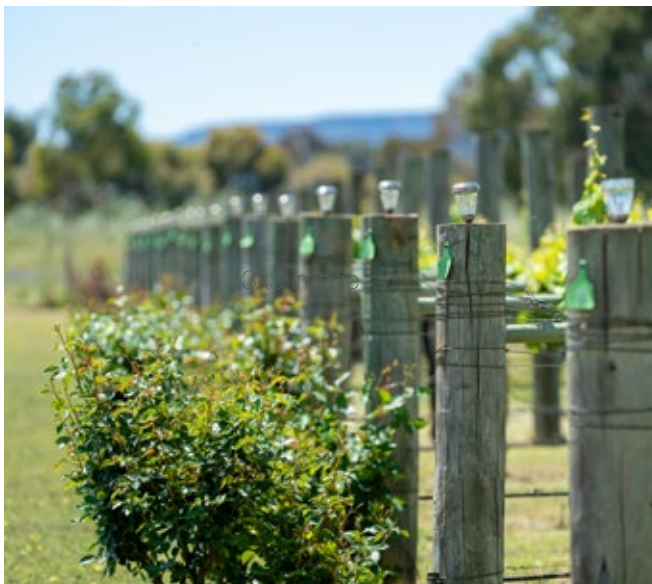
Swan Valley Wine Region

Ariella is surrounded by established areas like Ellenbrook, Midland and the Swan Valley, with a great range of services already up and running. The brand-new Brabham Primary School is located within the community, so you can walk the kids to school. In addition, you can look forward to having the future Whiteman Park Train Station and the growing Brabham Town Centre close to home.