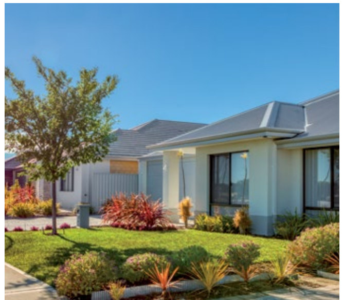
Streetscapes at Ariella Private Estate