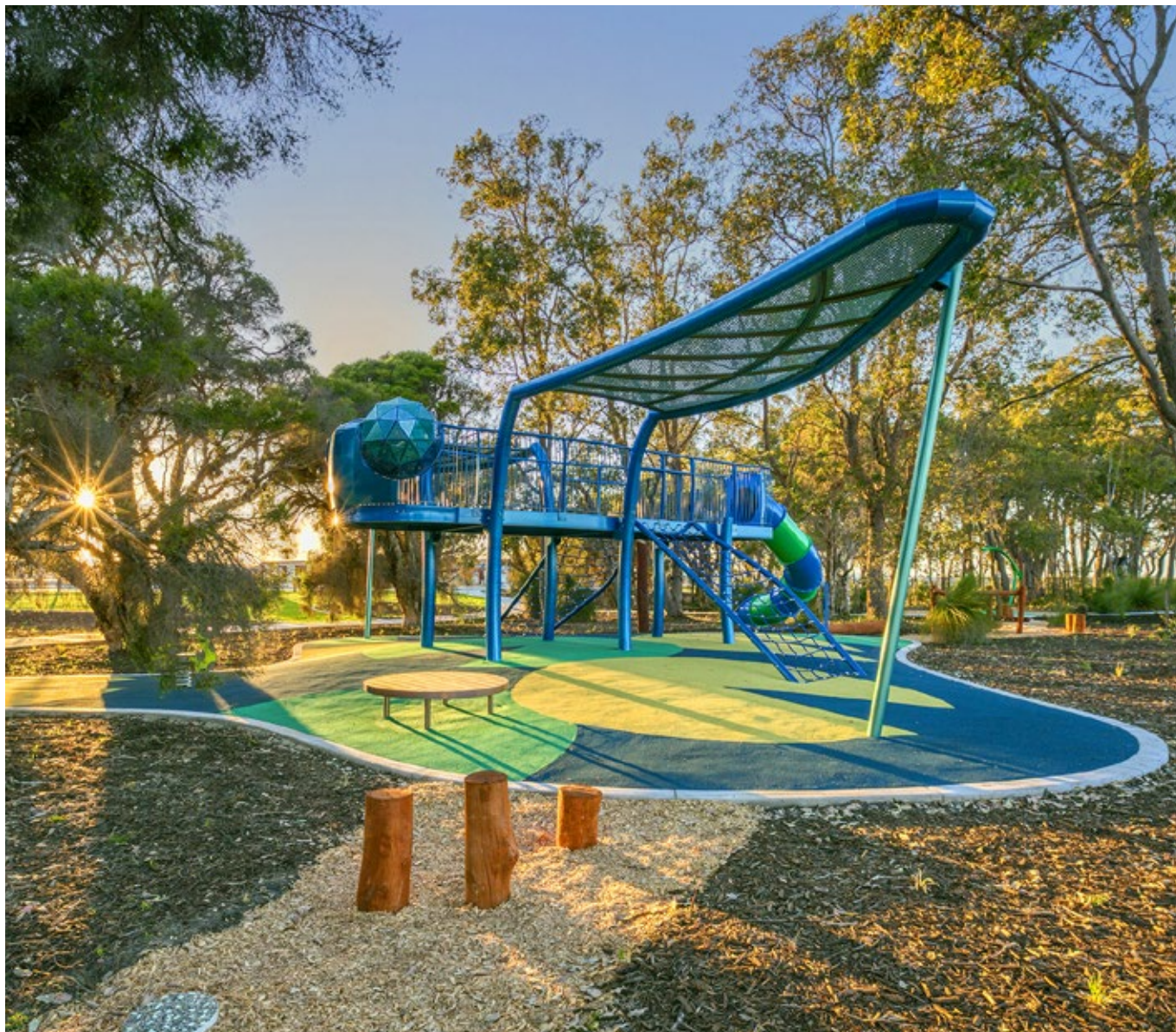
Ariella Adventure Park

“For us, the location was just excellent in respect to the city, the Swan Valley and everything they have to offer. In Ariella itself you have the schools, the shopping centres, the medical centre coming up... it is an exciting place to call home.”