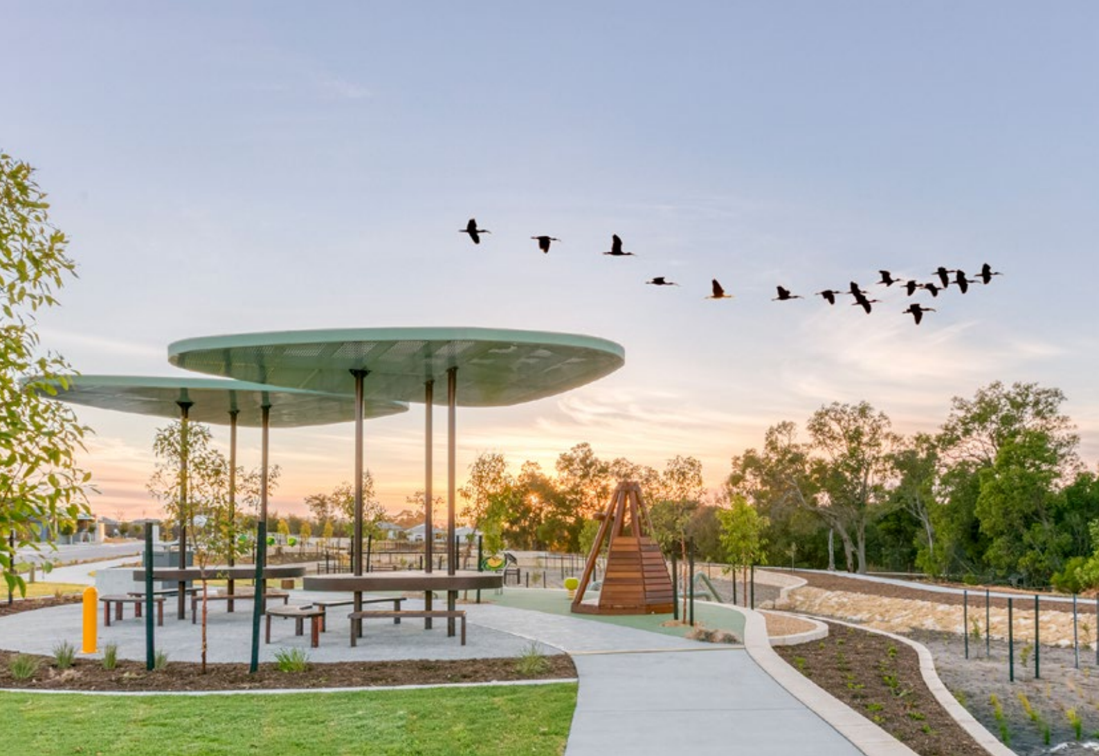
Ariella Conservation Wetland Park