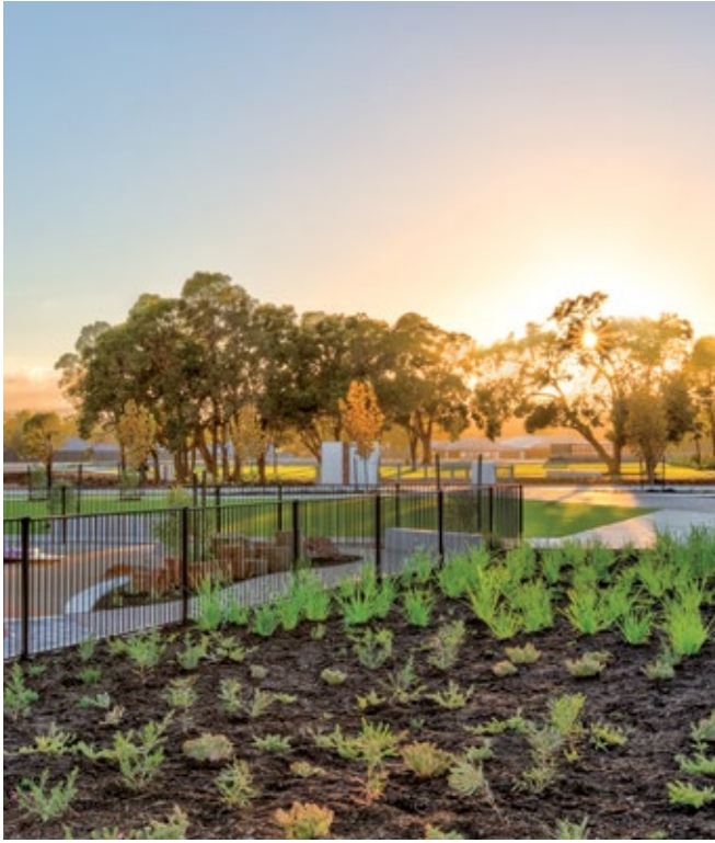
Bushmead – Bushmead (WA)