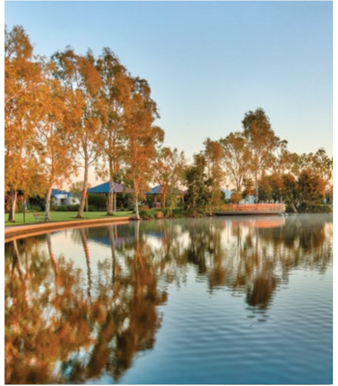
The Rivergums – Baldivis (WA)